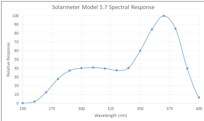
Fig. 1. Model 5.7 UVA & UVB

Total UV (A+B) Meter • 0-1999 \mu\text{W}/\text{cm}^2