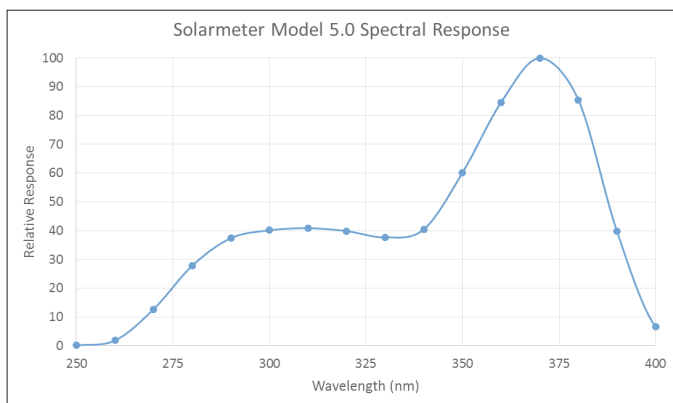
Fig. 1. Model 5.0 Spectral Response